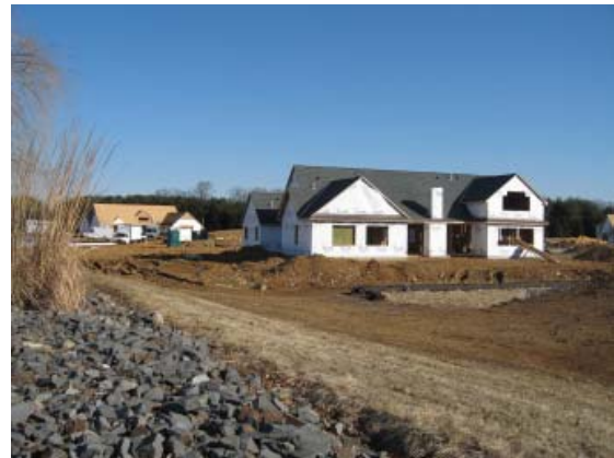
Gaelsong Single Family homes during construction.