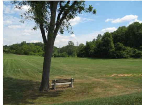
View of the Gaelsong site prior to construction.