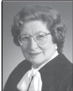
The Honorable Elizabeth Ehrlich