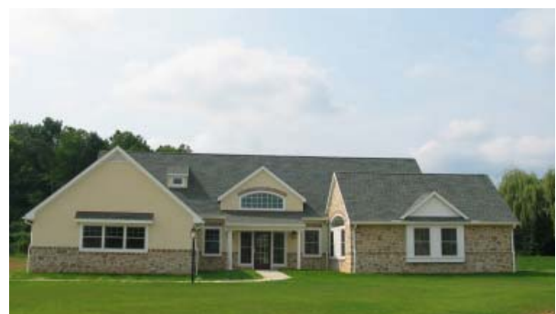
Completed Gaelsong home in July 2009.